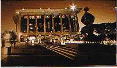
The Dorothy Chandler Pavilion of LA Opera

Since your opera performance of Il Postino is the opening night of a world premier, you might wish to choose dressy clothes (otherwise plan for nice casual clothing and good walking shoes!)